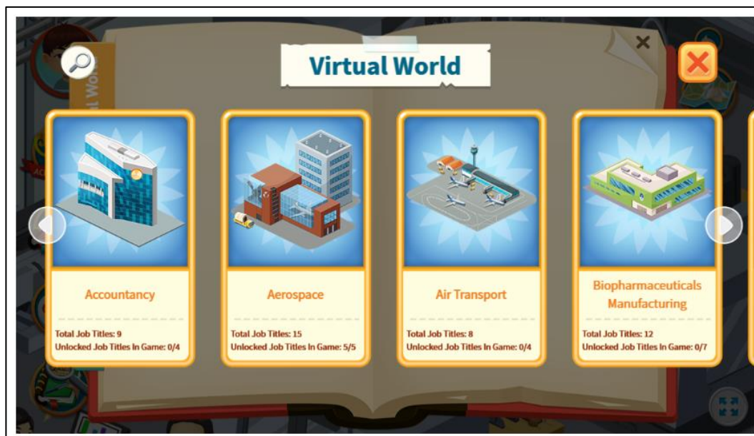
Figure 4-2: Virtual World (Explorer Book)

The Explorer Book (Figure 4-1) keeps a record of your progress in Career Quest and provides more information about job roles, Work Values and Mini Games .