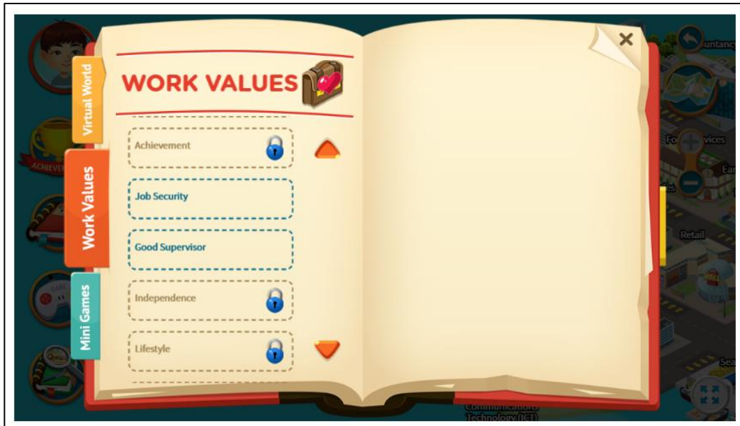
Figure 4-3: Work Values (Explorer Book)