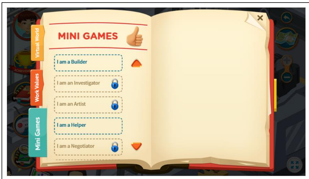
Figure 4-4: Mini Games (Explorer Book)